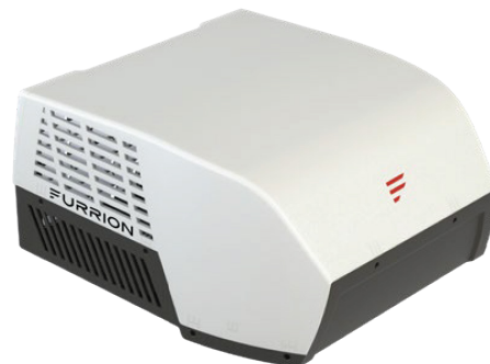
FURRION CHILL™ 18K BTU "WHISPER QUIET" CHILL® CUBE VARIABLE SPEED ROOFTOP AIR CONDITIONER LARGEST AIR CONDITIONING SYSTEM IN OUR CLASS!